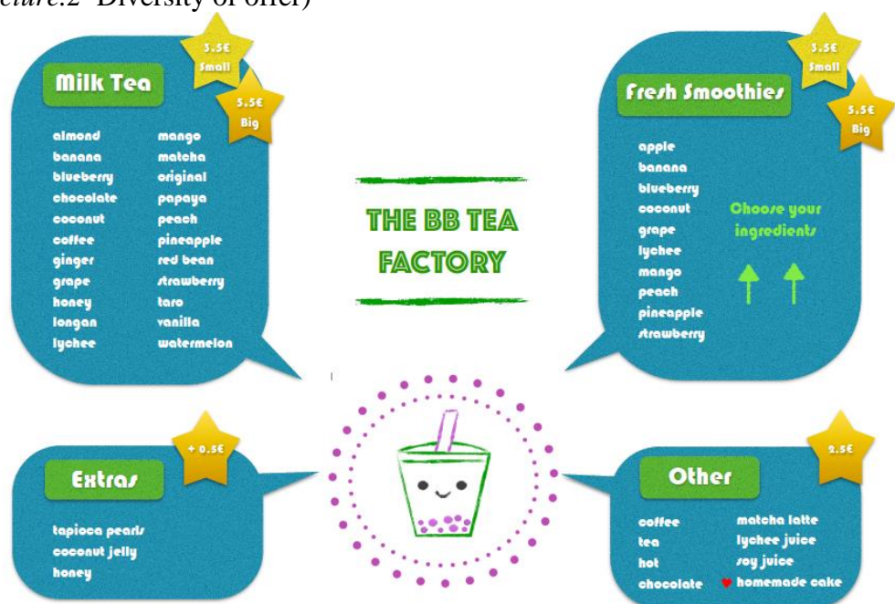
Picture.2 Diversity of offer